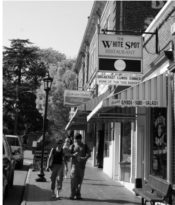
The Corner, near UVA Central Grounds

Antiques. Albemarle and nearby counties are a heaven for antique shoppers. Ask us for the name of our local antiques maven, who will gladly discuss your options!