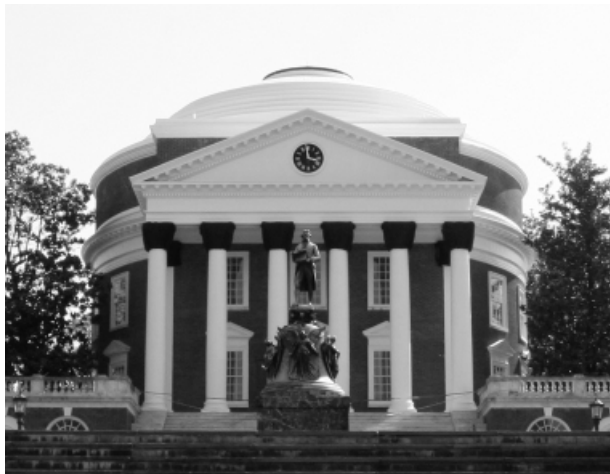
Jefferson's Rotunda at UVA

Arts. For a town of its size, Charlottesville has a robust art scene, including several small galleries (many of which are situated on or near the Downtown Mall), a handful of festivals, a drama venue ( www.livearts.org ), several music venues, and more. Consult the city's website for more information.