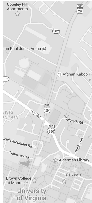
UVA Central Grounds

RBS participants are required to come to class on time. If you wish to take notes, plan accordingly. Pencils, paper, and other supplies are available nearby at the UVA bookstore. You may need to bring a computer; consult your course description for more information. If you do, it's also a good idea to bring an ethernet cable, as you may be required to register a wired connection before connecting to a wireless network. (Cables can also be purchased at the UVA bookstore.)