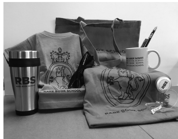
Merchandise from the RBS Notions Shop

* Required activities are noted by asterisk