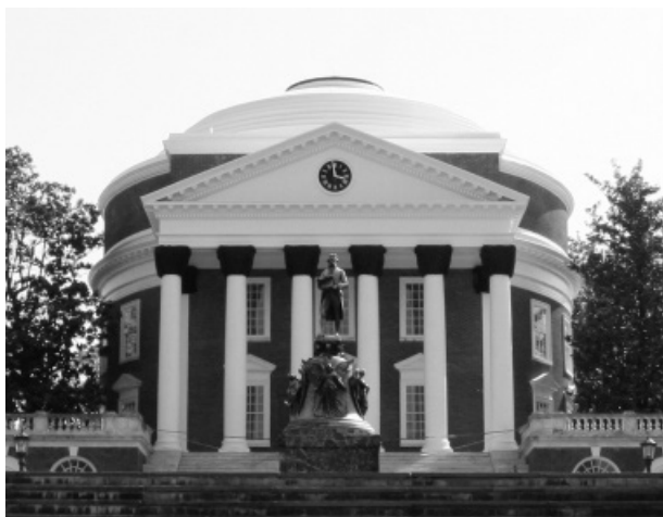
Jefferson's Rotunda at UVA

Arts. For a town of its size, Charlottesville has a robust art scene, including several small galleries (many of which are situated on or near the Downtown Mall), a handful of festivals, a drama venue ( www.livearts.org ), several music venues, and more. Consult the city's website for more information.