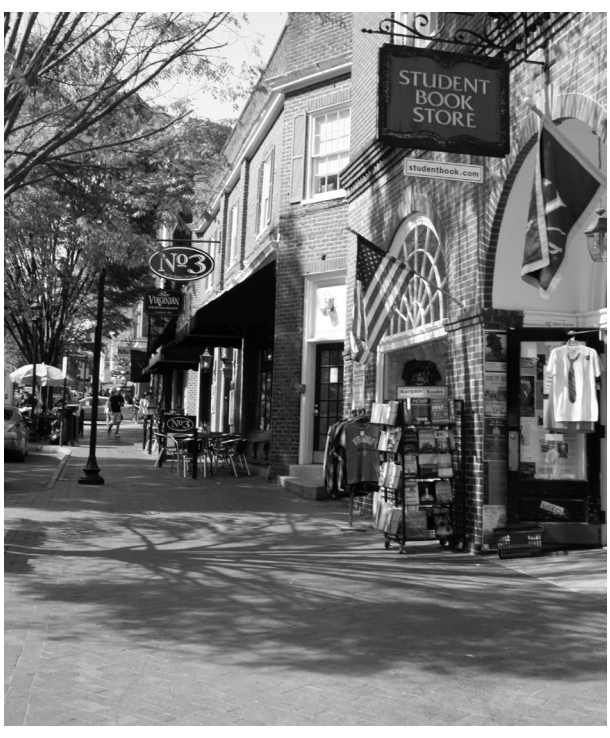
The Corner, near UVA Central Grounds

Antiques. Albemarle and nearby counties are a heaven for antique shoppers. Ask us for the name of our local antiques maven, who will gladly discuss your options!