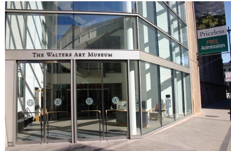
The Walters Art Museum

Consult the Visitor Information Desk in the Centre Street Lobby at the Walters Art Museum for lost items at 410-547-9000, ext. 264.