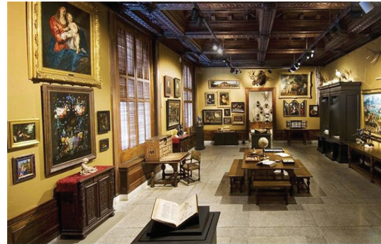
Chamber of Wonders at the Walters Art Museum

RBS will host a reception in the Parlor Room at the Walters Art Museum from 4-5:30 pm on Friday afternoon.