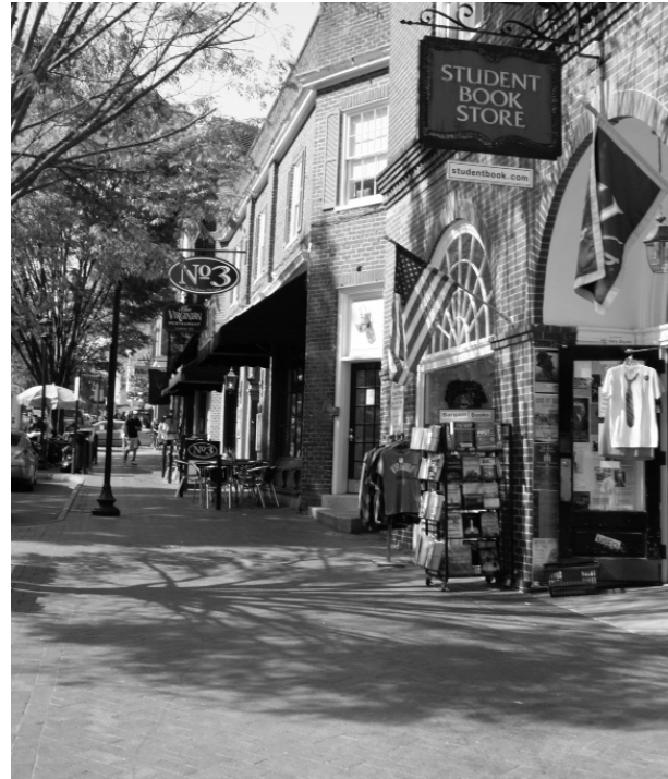
The Corner, near UVA Central Grounds

Antiques. Albemarle and nearby counties are a heaven for antique shoppers. Ask us for the name of our local antiques maven, who will gladly discuss your options!