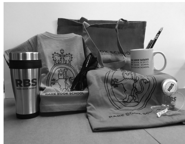
Merchandise from the RBS Notions Shop

* Required activities are noted by asterisk